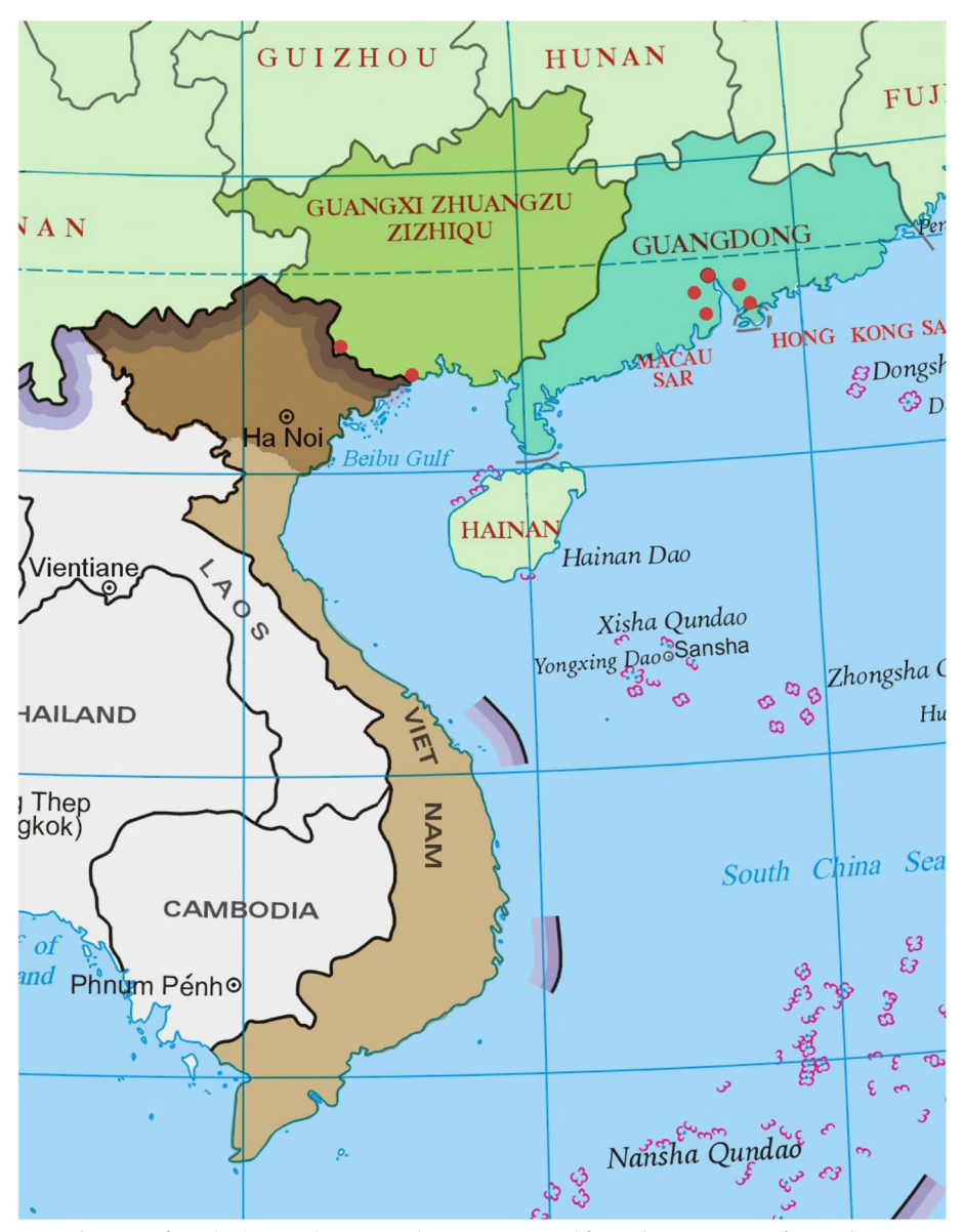
Fig. 2 The map of South China and Vietnam (This map is sourced from China's Ministry of Natural Resources. The red dots are our field sites. The darker brown area indicates northern Vietnam, the lighter brown area indicates central and southern Vietnam, the darker green area is Guangxi, and the lighter green area is Guangdong)

in GDP per capita, while Guangdong enjoys economic affluence, partially attributed to its progressive and politically adaptable governance.