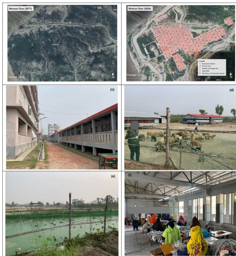
Fig. 3 The evolution of the Bhasan Char Island, Noakhali, Bangladesh, between (a) 2017 and (b) 2024 [Source: Google Earth]; and (c) a typical housing unit; and (d-f) various types of livelihood activities on the island. Source: Field photographs, Bayes Ahmed, January 2023

the mainland camps in Cox's Bazar (UNHCR, 2024a; Uddin, 2024a). Known locally as Bhasan Char, is deemed physically stable in terms of its structure, morphology, size, shoreline change, and resistance to inundation from cyclones and storm surges (Gazi et al., 2022). Although, the island was newly formed and did not exist before 2018 (Fig. 3a, b), it has been equipped with various facilities such as embankments, emergency shelters, wave bankers, modern housing, and community facilities—including schools, mosques, a lighthouse, health centres, a mobile phone network, and playgrounds. These developments, along with ample livelihood training and opportunities (Fig. 3d-f), aim to make the island more appealing and temporarily liveable for the Rohingyas (Islam et al., 2021). Despite these modern amenities, the Rohingyas remain reluctant to relocate to Bhasan Char due to fears of isolation, natural disasters, and mistrust (Uddin, 2024a). They perceive it as an open prison, and many have attempted to escape the island using dangerous sea routes to Malaysia and Indonesia (Fig. 1). Estimates indicate that one in every eight Rohingya who undertook this perilous journey died or went missing, making it one of the deadliest illegal migrations routes in the world. In 2023 alone, over 4,500 Rohingyas embarked on this journey from Bangladesh and Myanmar (UNHCR, 2023b),