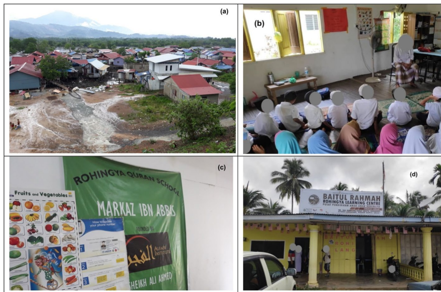
Fig. 2 (a) Informal Rohingya settlements in Bukit Malut; and (b-d) Rohingya learning centre in Baitul Rahmah, Lankawi, Kedah, Malaysia.

narratives to explain how they see their resettlement perspectives and the determinants for their preferences to go (or not) to a third country.